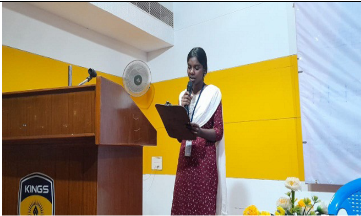
Solo singing by a participant