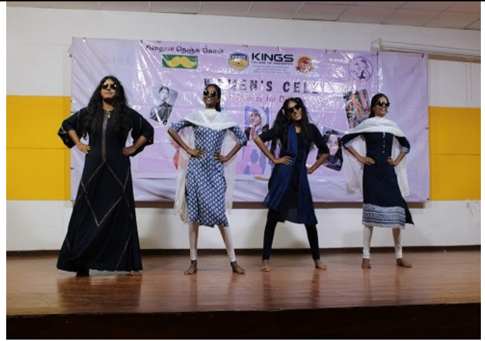
Dance performance by students